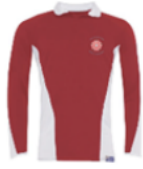
Boys Rugby Shirt*