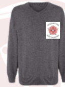
Grey 6th Form V Neck Jumper* or Cardigan* with school badge