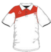
Boys Indoor PE Top*