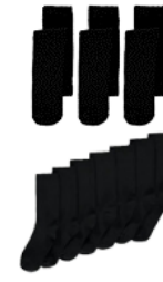
Tights / Socks (Plain black)