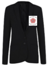
School Blazer* All Year Groups 7-11

Our core uniform: Embroidered items are limited to compulsory School Blazer and coloured Year tie