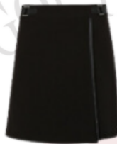
Skirt: Plain black knee length for Yrs8-11, new plaid style* for Yr7