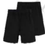
Plain Black PE Shorts