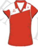
Girls Indoor PE Top*