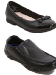
Plain Black Shoes Smart and polishable