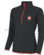
Girls 1/4 Zip Sports Top*