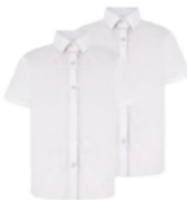
White Shirt Long/short sleeve