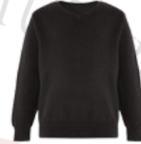
Plain Black V Neck Sweater (Optional)